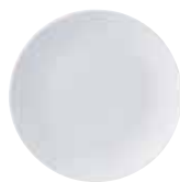
dessert plate 21cm/8.3"