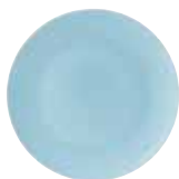
dessert plate 21cm/8.3"