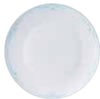
dinner plate 27cm/10.6"