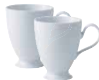
mug pair 14cm/5.5"