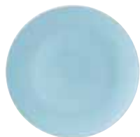
dinner plate 27cm/10.6"