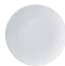
bread + butter plate 16cm/6.3"