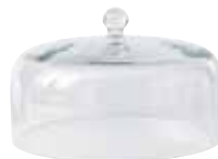
cake dome 30cm/ 11.8" to fit large cake stand