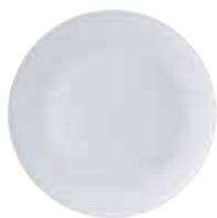
dinner bowl 26cm/10.2"