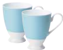
mug pair 14cm/5.5"

1 x dinner plate 1 x dessert plate 1 x cereal bowl 1 x mug