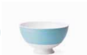
cereal bowl 15cm/5.9"