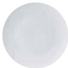
round serving plate 35cm/13.8"