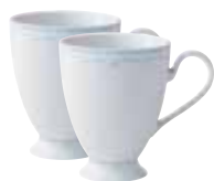
mug pair 14cm/5.5"