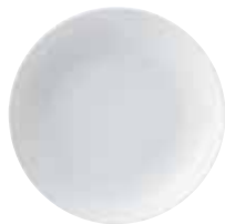
dinner plate 27cm/10.6"