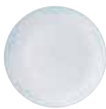
dessert plate 21cm/8.3"