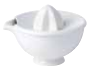
citrus juicer 15cm/5.9"