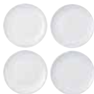
tidbit plates Set of 4 16cm/6.3"

1 x dinner plate 1 x dessert plate 1 x cereal bowl 1 x mug